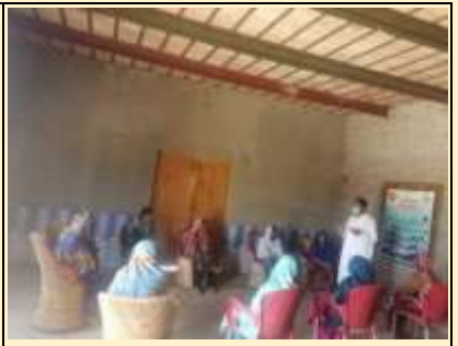
@ District Shikarpur