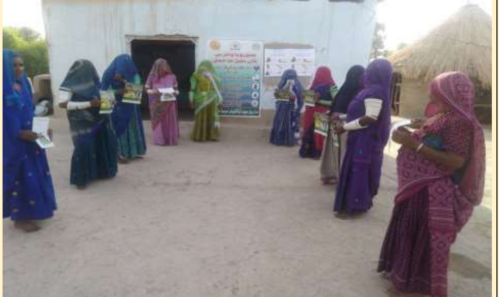
July 18, 2020 Community Institution's distributed IEC material in Jacobabad