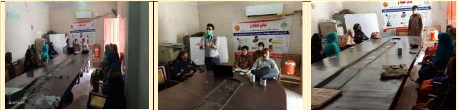
COVID-19 community session, hand washing activity and orientation of Staff and Cis on COVID by Health department at district Shikapur June 17, 2020.