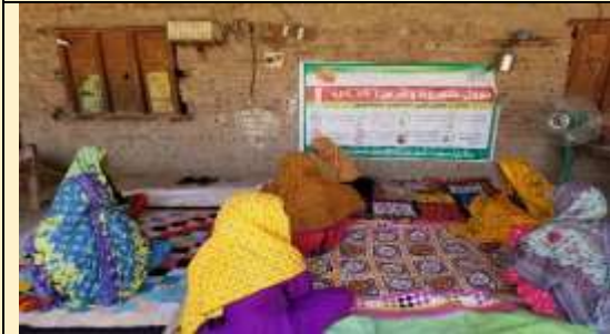
@ District Kashmore @ Kandhkot