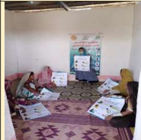
July 18, 2020 LSO Representative distributed IEC material-District Mirpurkhas