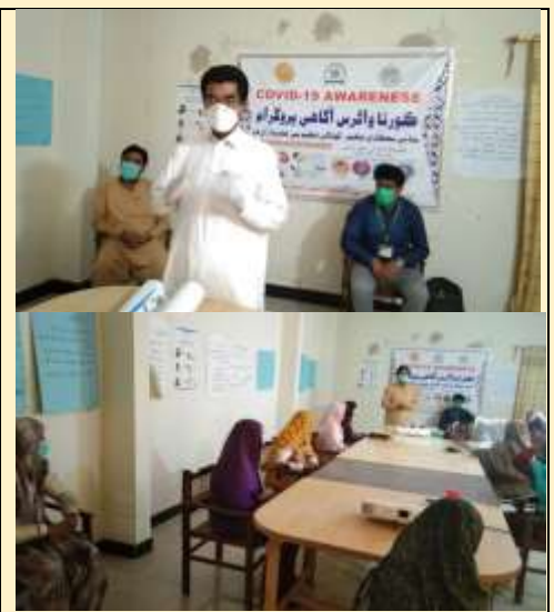
LSO members orientation on COVID Awareness by District administration Representative under NCOC agreement- District Mirpurkhas