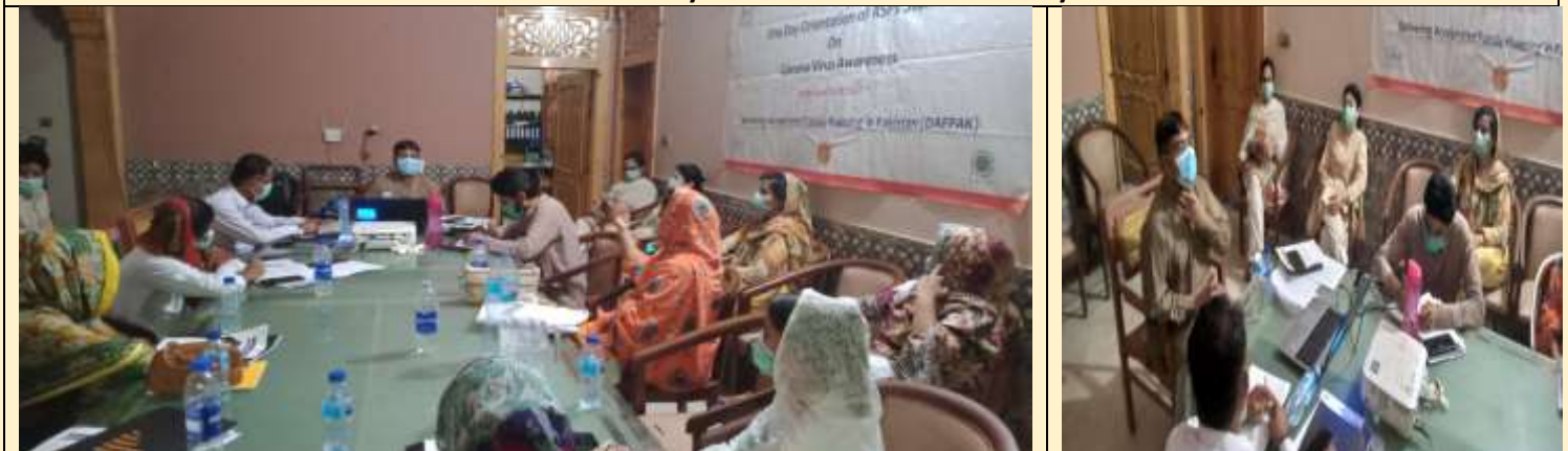
PSI project team orientation on Covid-19- Jacobabad