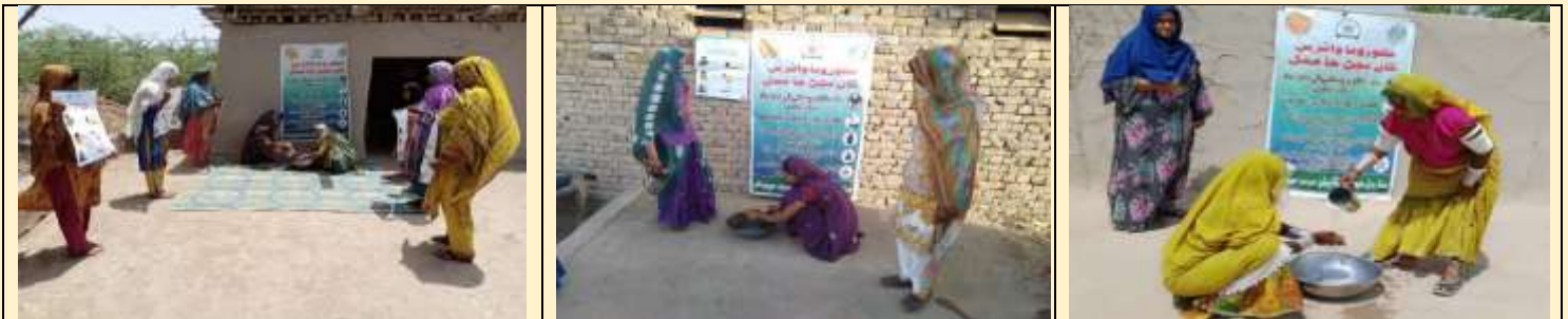
Hand Washing Activity in different villages of District Mirpurkhas