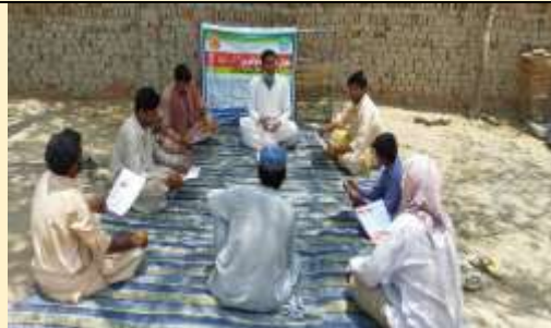
@ District Jacobabd