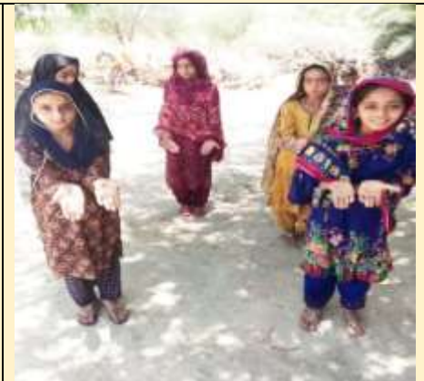
Community based sessions COVID-19 hand-washing activity was conducted on July 19, 2020 with women, girls and boys by Community Institutions in District Kashmore @ Kandhkot.