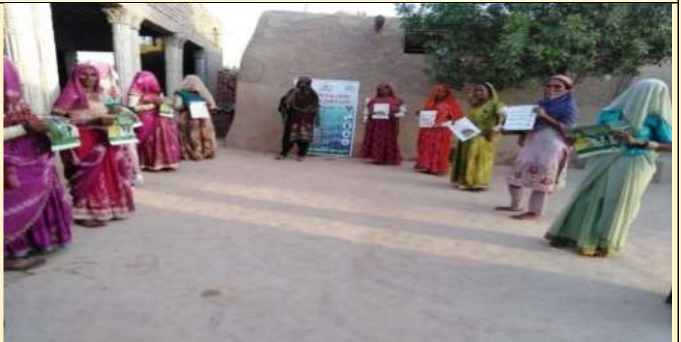
On July 15, 2020 NCOC material distribution in district Mirpurkhas