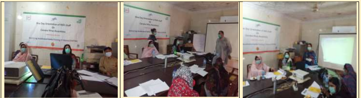
DAFPAK team one day Orientation on COVID-19 by RSPN

Rural Support Programme Network (RSPN) conducted orientation sessions on COVID-19 for SRSO Teams on June 25, 2020 at District Shikarpur and Jacobabad District.