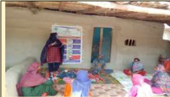
@ Village Peer Malook District Thatta