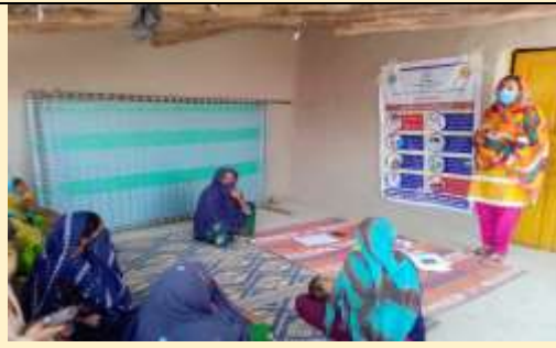
@ Village Sajan Khaskheli District Badin