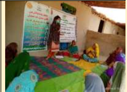
@ District Mirpurkhas